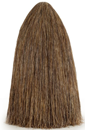
CNA010 contenitore cabinet élément de rangement Kredenz

Structure with a central bearing pillar and 5 brown lacquered steel shelves.